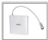
explosion proof battery (included)